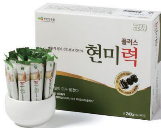
240g 4g x 60 pack of granular

Take 2~3 times a day with water, or season it on your usual meal