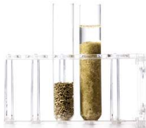
Expansion of Hyunmiryeok Plus when absorbing water